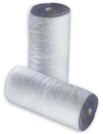
Figure 1: Aquatrex filters